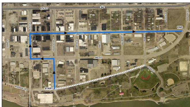
City of Yankton 2024 Parade Route