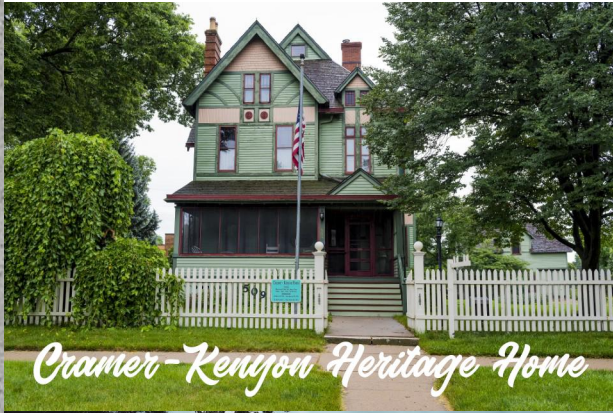
Cramer-Kenyon Heritage Home

The Mead Museum and Cramer-Kenyon Heritage Home have partnered to offer bundle savings for your next trip! Visitors to the Mead Museum will receive a coupon for $3 off adult admission to the Cramer-Kenyon Heritage Home.